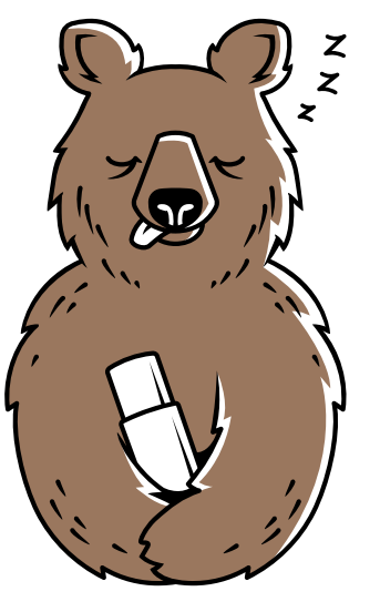
HAVEN'T HAD COFFEE YET