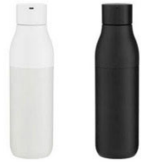
granite white #74671 obsidian black #74644

25 oz double wall premium electropolished 18/8 stainless steel thermal self-cleaning bottle with vacuum insulation, threaded lid, 280nm PureVis UV-C LED technology, and powder coated finish also available in 17 oz