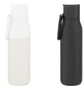
granite white #74371 obsidian black #74344

3 | pricing varies based on the imprint method, number of imprint colors, and quantity ordered