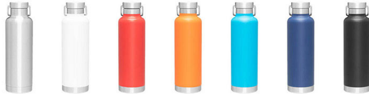
stainless #989061 white #989571 red #989573 orange #989575 aqua #989570 navy #989572 black #989544

24 oz double wall 18/8 stainless steel thermal bottle with copper vacuum insulation, threaded stainless steel insulated lid, swing handle, high polish stainless steel rim, stainless steel base, and powder coated finish