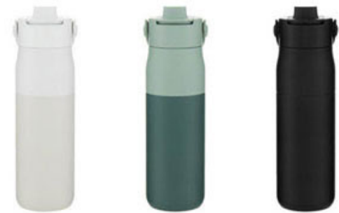
granite white #73171 eucalyptus green #73137* obsidian black #73144