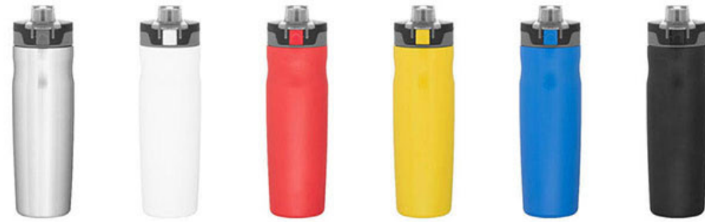
stainless #925061 white #925371 red #925383 triumph #925359 victory #925382 black #925344

20.9 oz double wall 18/8 stainless steel thermal bottle with copper vacuum insulation, threaded lid, push-button locking mechanism, drinking spout, spout cover, removable carrying strap, and powder coated finish