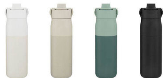
granite white #72971 mojave dune #72904 eucalyptus green #72937* obsidian black #72944

23 oz double wall premium electropolished 18/8 stainless steel thermal self-cleaning bottle with vacuum insulation, threaded lid with swig top cap, inner straw, silicone straw holder, soft removable carrying handle, 280nm PureVis UV-C LED technology, nano zero filtration system, and powder coated finish integrates with app for hydration tracking · also available in 34 oz